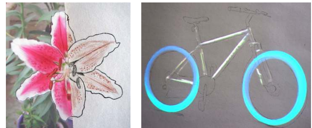
(a) Lily flower.